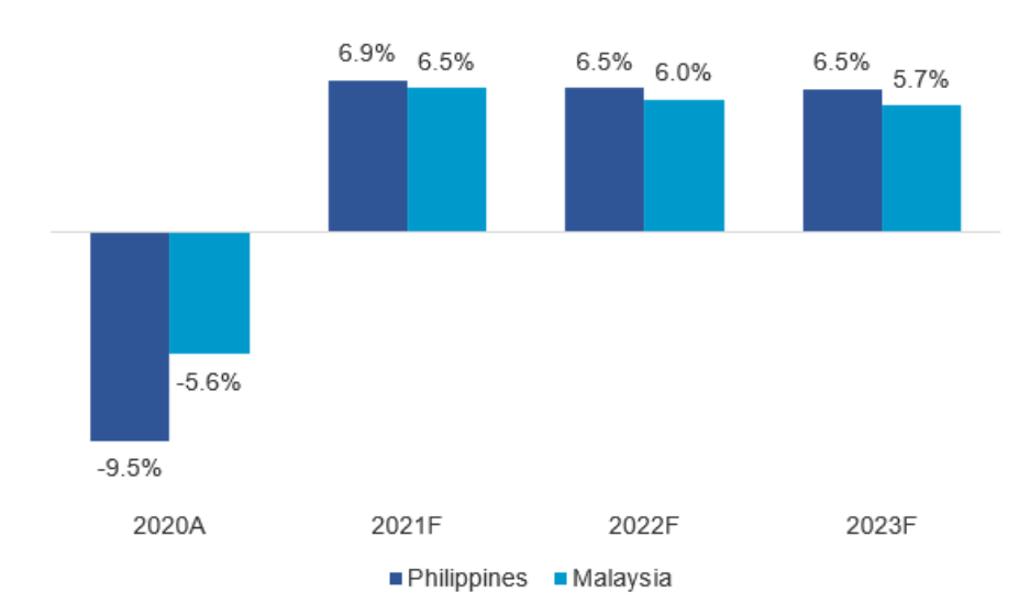
Figure 2: Real GDP Growth (2020A to 2023F)