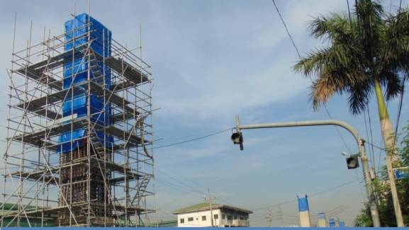
Ongoing works on Section 4