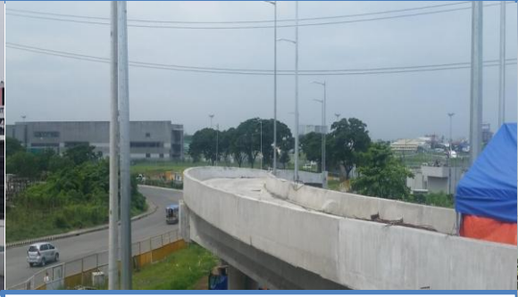
Ramp to Terminal 3 (Ramp 4)